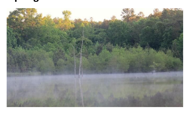
Pond near Carolina North in the early morning