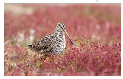
South American Snipe

The Falkland Islands, an archipelago located in the Southern Ocean approximately 270 miles east of the southern tip of South America, are one of the last untouched wildlife wonders of the world. For birders and photographers alike, a visit to the Falklands provides the ultimate in up-close animal encounters.