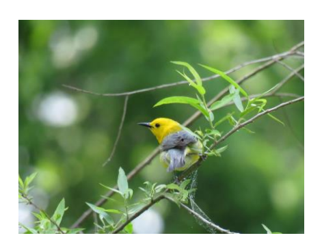
Prothonotary Warbler University Lake