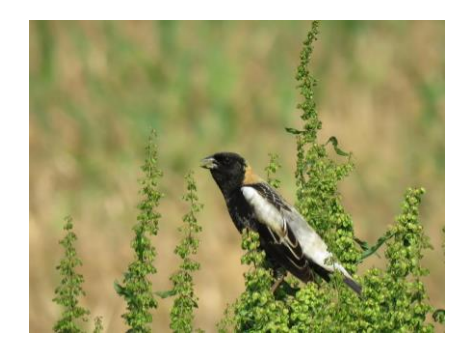
Bobolink Mapleview Farm