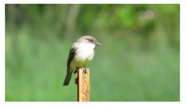
Eastern Phoebe near Bolin Creek