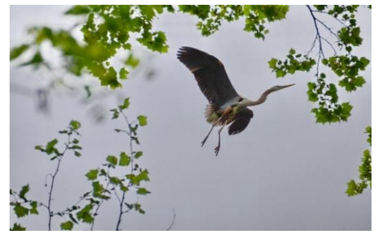
Eastern Kingbird Great Blue Heron Jordan Lake Count near Deep River, May 1, 2016