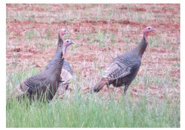
Eastern Kingbird Wild Turkeys