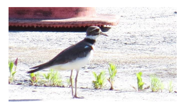
Killdeer behind a building off Municipal Drive