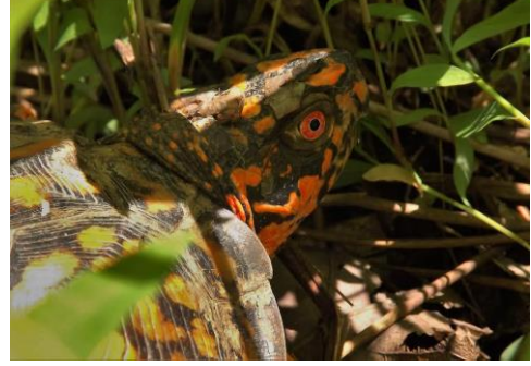
Eastern Box Turtle

These are a few shots I took while participating in the 2016 Chapel Hill Bird Count on Saturday 5-7-2016. My count area was Carolina Meadows. I covered the residual areas and game lands between the campus and Morgan Creek. For what it's worth I'll mention, that I think the most interesting capture I got was some video of a Louisiana Waterthrush performing a broken wing display when I apparently got close to a nest.