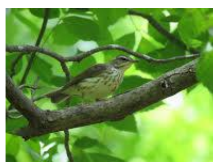
Louisiana Waterthrush University Lake