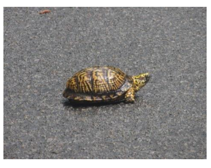
These are all from the New Hope Audubon Jordan Lake spring bird count. Margaret Vimmerstedt at abandoned road Parkers Creek. Great Blue Heron at Parkers Creek. Box Turtle crossing closed road a Popular Point.