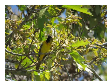
Orchard Oriole Arthur Minnis Road